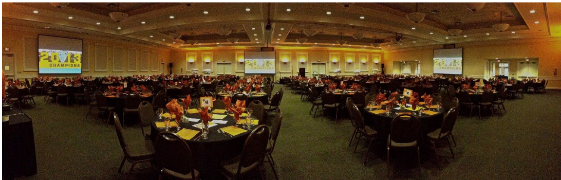
CH2M HILL Alumni Center Cascade Ballroom