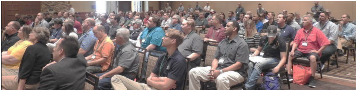
Past Opening Remarks and Keynote Session

We encourage sponsors to commit early to maximize the amount of exposure for their company and to secure any of the limited event sponsorship options. Sponsors gain recognition in multiple ways before and throughout the conference including the website, email marketing, and acknowledgment at any sponsored events. Sponsors can bring a banner or sign to post at any event or activity they choose to sponsor.