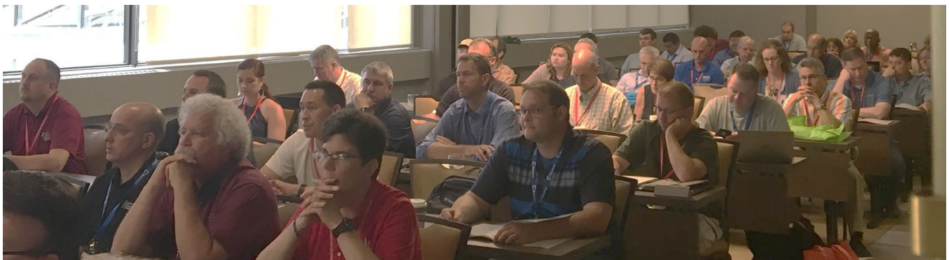
Past Technical Session